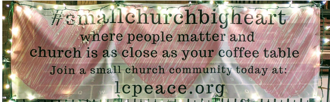
Small Church gatherings + Zoom worship