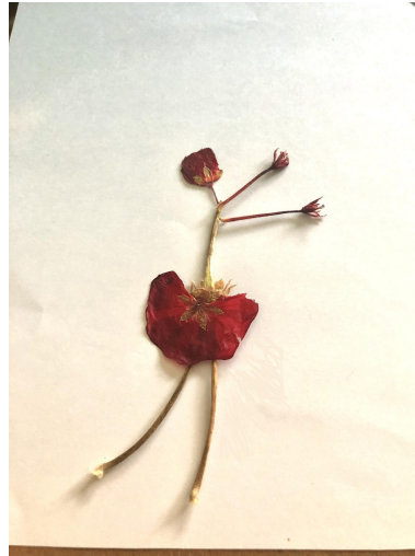
Art and Scripture