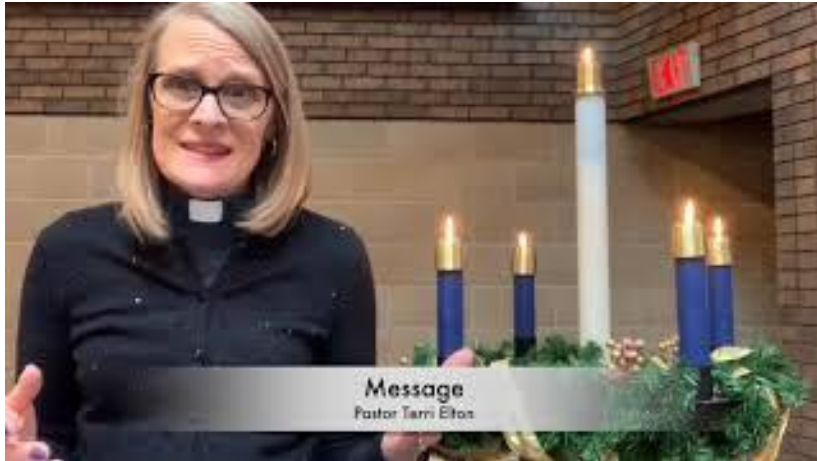
Christmas Day Worship